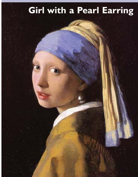
Girl with a Pearl Earring

Monday 19th – Saturday 24th October 2009